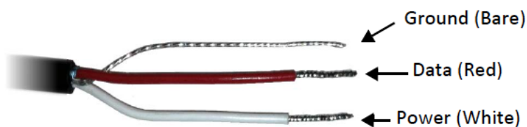
Figure 2: Pigtail End Wiring

Customers may purchase GS1 sensors for use with non-Decagon data loggers. These sensors typically come configured with stripped and tinned (pigtail) lead wires for use with screw terminals. Refer to your distinct logger manual for details on wiring.