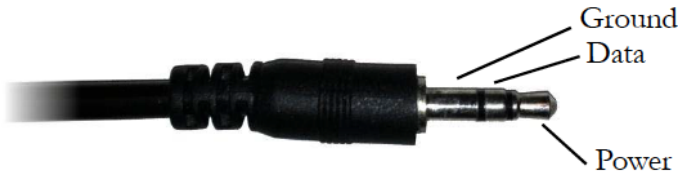
Figure 1: Stereo Connector

Decagon designed the GS1 sensor for use with our Em50 series data loggers, the Em5b, or the ProCheck handheld reader. The standard sensor (with a 3.5 mm “stereo plug” connector) quickly connects to and is easily configured within a Decagon logger or ProCheck. (Figure 1)