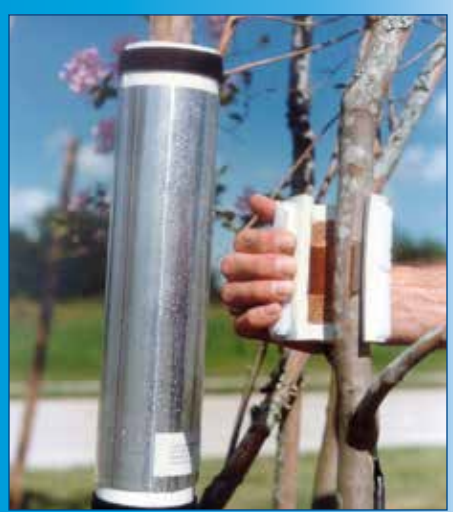
Trunk gages and stem flow gages.