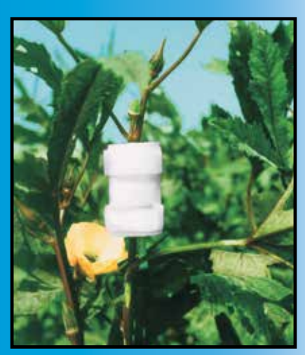
SGA5 microsensor, with weather shield, monitors okra plant transpiration.